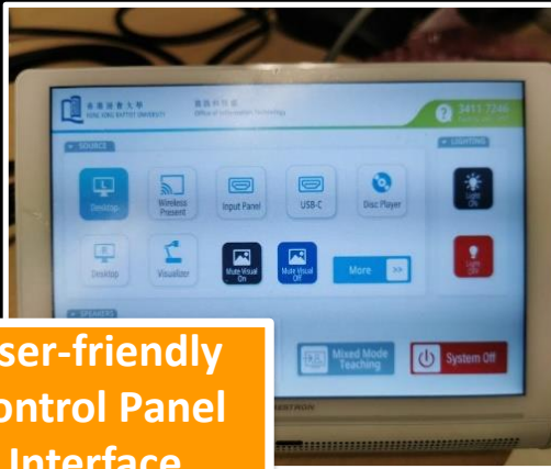
User-friendly Control Panel Interface