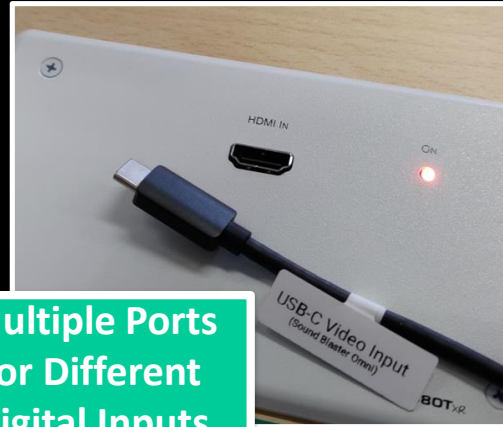
Multiple Ports for Different Digital Inputs